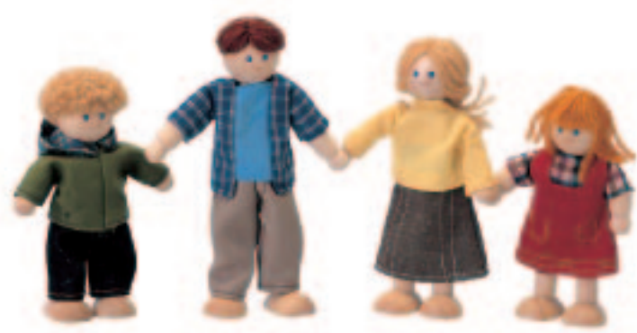
X74150 DOLL FAMILY (CAUCASIAN)