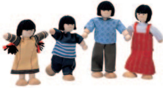
X74170 DOLL FAMILY (ASIAN)

All doll families are compatible with any PlanToys® dollhouse. Father measures 5.5" tall.