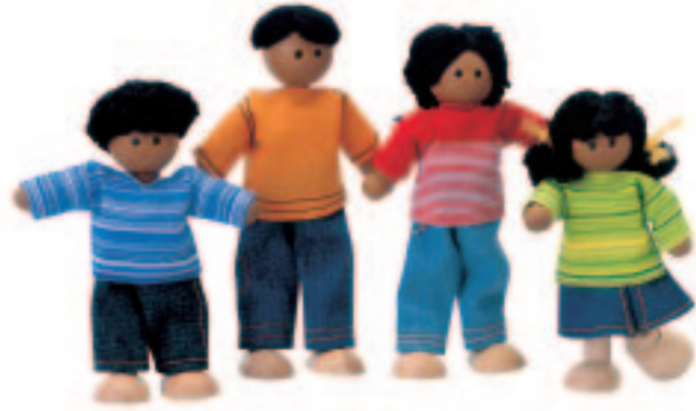
X74160 DOLL FAMILY (ETHNIC)